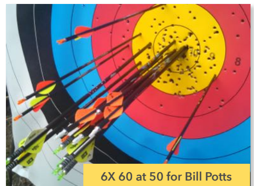
6X 60 at 50 for Bill Potts