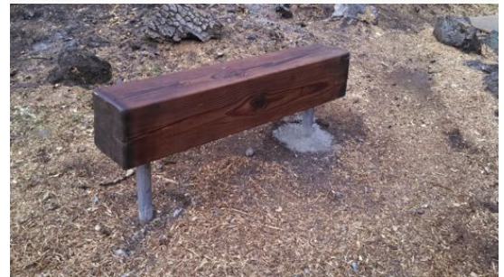
The new bench at T14