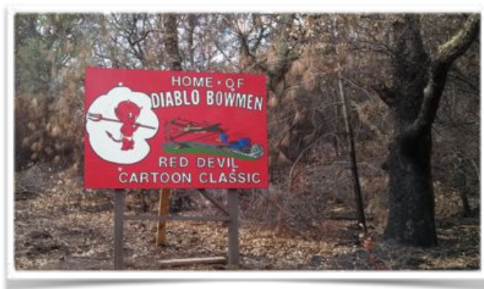
The Cartoon Classic billboard is back in place.

Thank You to all of our members for your hard work on the range, it is looking good! We have come a long way since the fire. Hope to see you out shooting!