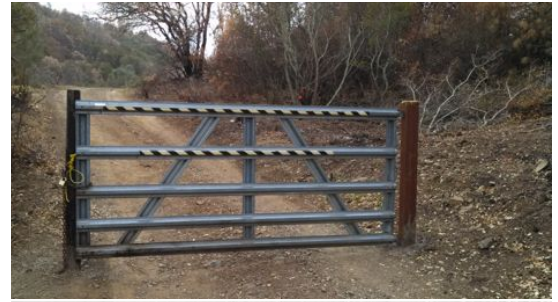
The Regalia Gate is back in place.