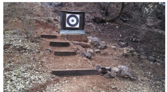
New steps at Target 44.