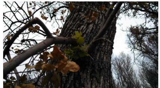
New growth on the range.